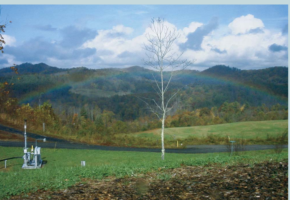
FIGURE 2 Capped landfill with methane recovery operation in Yancey County, North Carolina.

Numerous local governments, in partnership with complementary agencies, economic development authorities, and the private sector, are beginning to develop landfill methane projects (Figure 2). Solid waste landfills produce methane gas as a by-product of decomposition, which can be captured for productive uses. The stories of two of these illustrate the placespecific challenges and opportunities they afford. In Yancey County, North Carolina, beneath the Black Mountains-eastern America's highest—the Energy Xchange business incubator supports heritage crafts studios, green houses, and an education center. Arts and crafts in the moun-