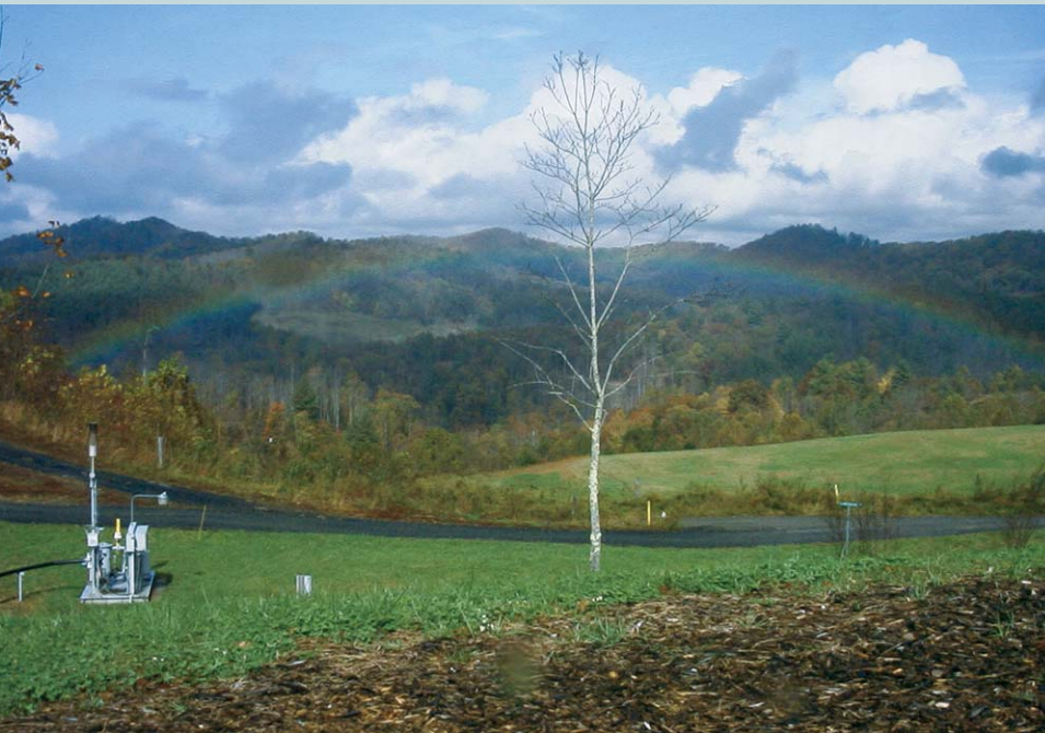
FIGURE 2 Capped landfill with methane recovery operation in Yancey County, North Carolina.

Numerous local governments, in partnership with complementary agencies, economic development authorities, and the private sector, are beginning to develop landfill methane projects (Figure 2). Solid waste landfills produce methane gas as a by-product of decomposition, which can be captured for productive uses. The stories of two of these illustrate the place-specific challenges and opportunities they afford. In Yancey County, North Carolina, beneath the Black Mountains—eastern America’s highest—the Energy Xchange business incubator supports heritage crafts studios, green houses, and an education center. Arts and crafts in the moun-